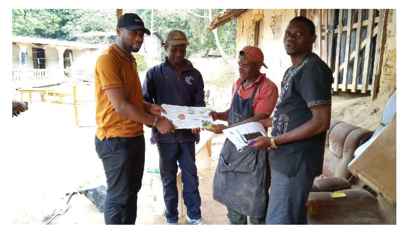
M- Remise des brochures de sensibilisation des PME/PMI et opérateurs artisanaux sur les procédures d'achat du bois légal auprès des entreprises forestières industrielles au Représentant du Président de l'Association ASTRABOIS de Bertoua, Est - Cameroun