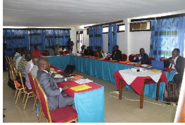
d- Vue de la salle au cours de l'Assemblée Générale Ordinaire de l'IFFB