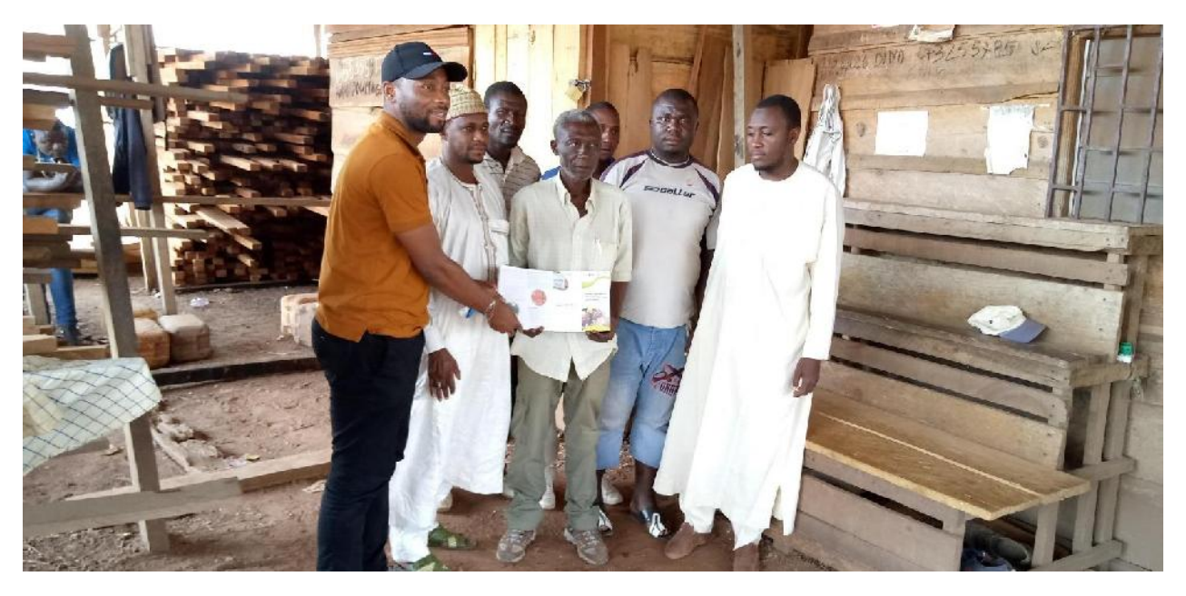
L- Remise des brochures de sensibilisation des PME/PMI et opérateurs artisanaux sur les procédures d'achat du bois légal auprès des entreprises forestières industrielles au Président de l'Association des vendeurs de bois de Bertoua, Est - Cameroun