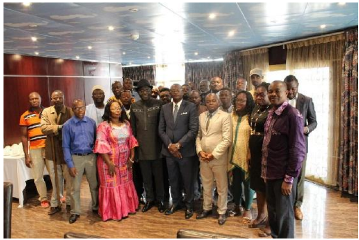
a-Atelier de validation de l'annuaire des PME/PMI et opérateurs artisanaux