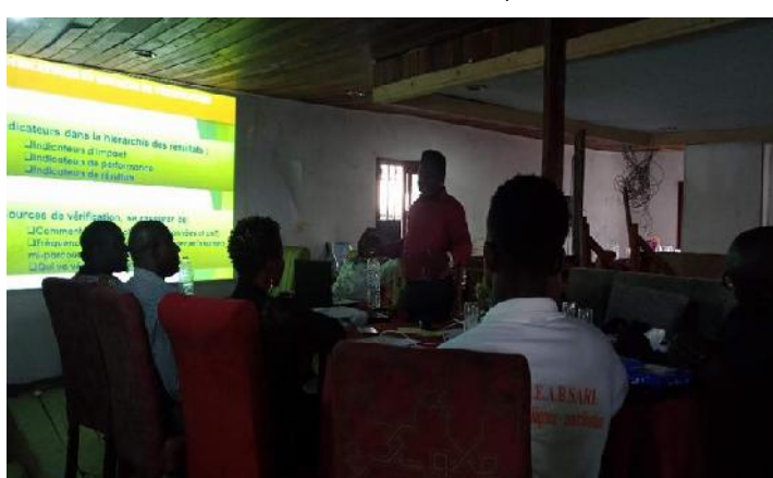
c-Formation des membres de l'association YLA en gestion des cycles de projet