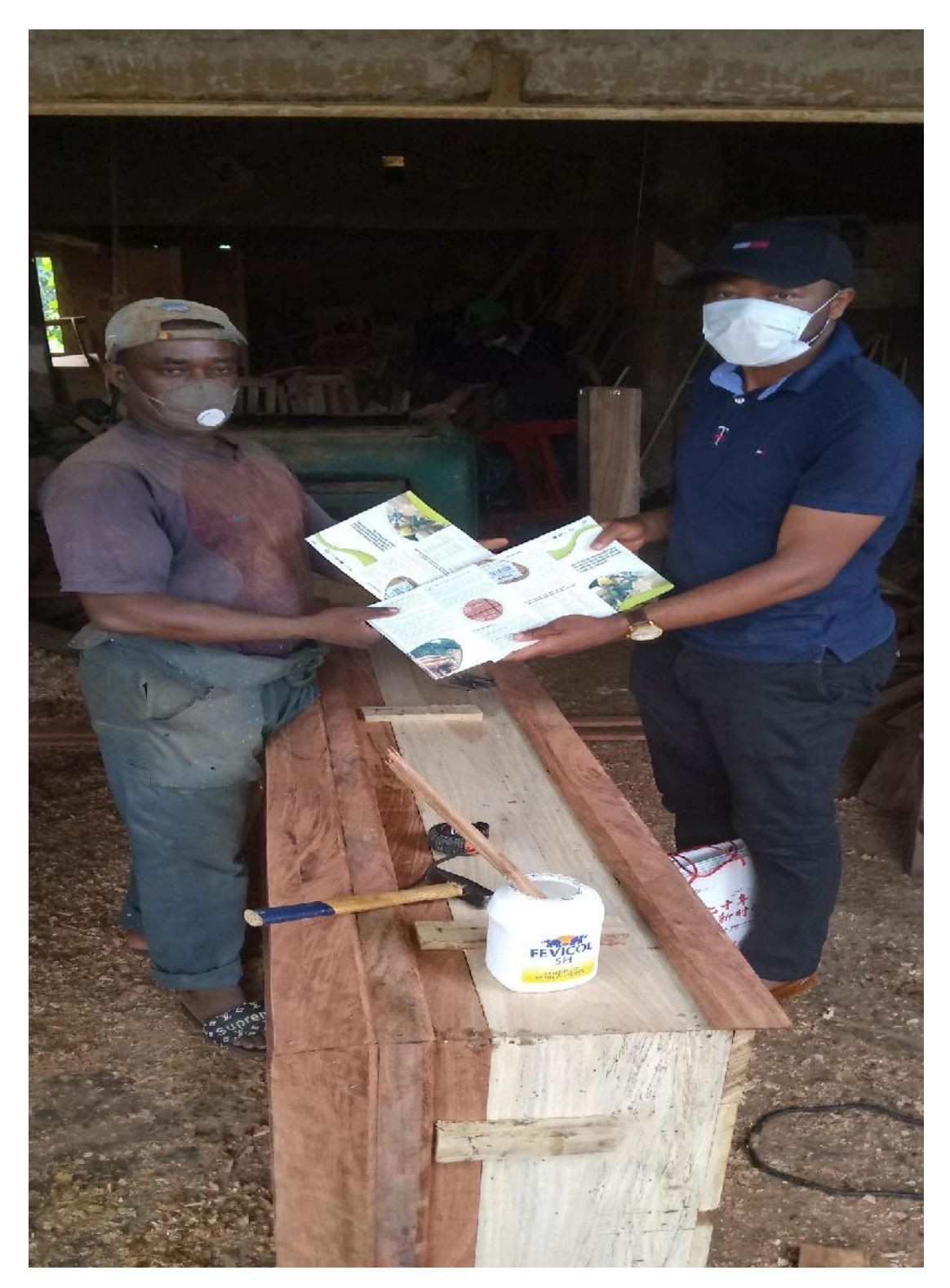
j- Remise des brochures de sensibilisation des PME/PMI et opérateurs artisanaux sur les procédures d'achat du bois légal auprès des entreprises forestières industrielles au Président de l'Association des Menuisiers d'Ebolowa , Sud - Cameroun