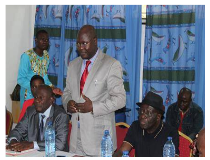
e-Mot du Représentant du MINPMEESA lors des AGO et AGE à Kribi en Août 2019