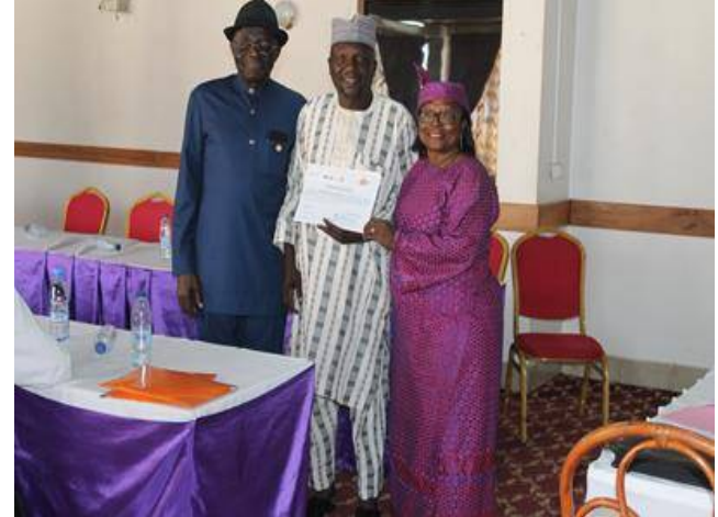
b- Remise des parchemins de formation au représentant de ARTI BOIS