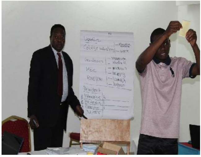
f- Dépouillement des bulletins lors du vote du Bureau Exécutif de l'IFFB